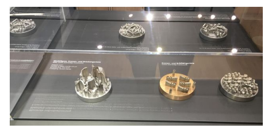
Substrate plates with 3D-printed dental prosthesis.