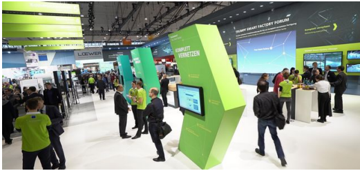
Thanks to the green T-shirts of the TruConnect consultants, visitors who had questions about the TRUMPF solutions for the Smart Factory quickly found what they were looking for.