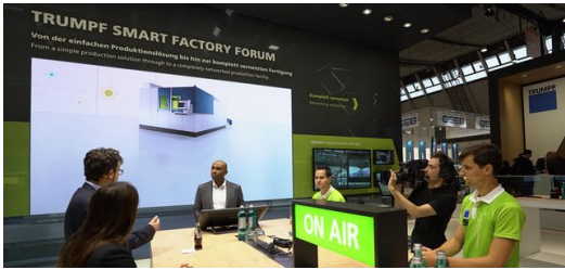
From consulting services to automation to fully digitally networked production - four TRUMPF experts answer questions from moderator Chris Brow.