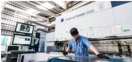
An employee working with the TruBend Center 5030 : This is how the "Orisu" chair is made.