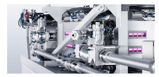
The excited mixture of gases in the CO2 laser glows red – this is where the high performance laser beam is produced.