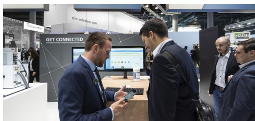
All 3D printers at the exhibition stand were connected to a digital MES

learn how much it will cost to produce the component and how long delivery will take. On top of that, the manufacturer can access the printers and the pending jobs' process data from anywhere in real time.