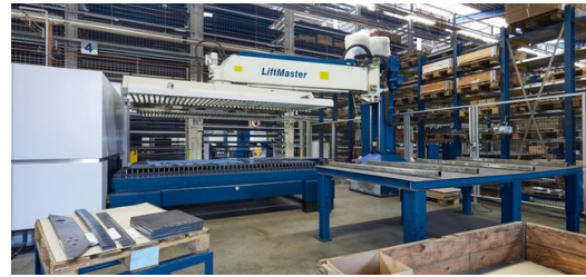
A Stopa storage system takes care of supplying materials while a LiftMaster makes it easier to handle parts.