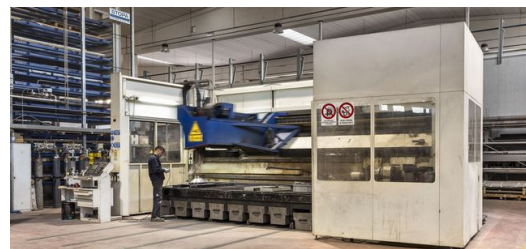
Multi-talented: ELFIM does not just use the LaserCell 1005 to weld and cut 2D and 3D components. The system is also suitable for laser metal deposition.