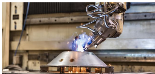
ELFIM uses the LaserCell 1005 for various applications of laser technology such as 2D and 3D cutting or welding and also for laser metal deposition.

perform a 3D scan of an existing replacement part.