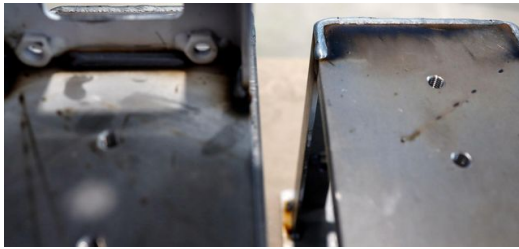
Consistently high quality welds and fast set-up: Automated welding with the new welding cell brings considerable advantages for zweifel metall ag.