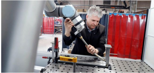
The TruArc Weld 1000 is the entry into simple welding for the company zweifel metall ag.