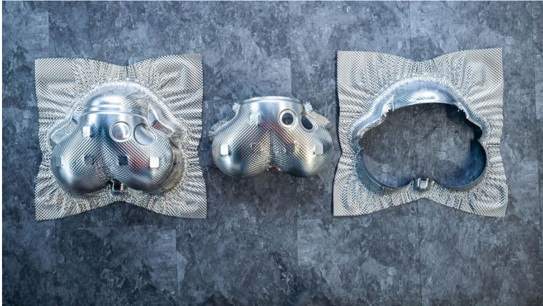
Deep-drawn form for a stainless steel outer shell (left), the 3D laser-cut final form (center) and overhang following removal (right).