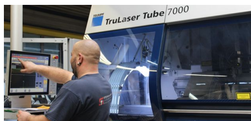
The finished program appears on the machine operator's terminal.