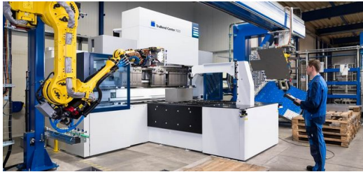
The new TruBend Center 7020 panel bender made production of the field stove possible in the first place. Only with this equipment was the team at Kuipers able to automatically bend the relatively large firebox of 333 millimeters.