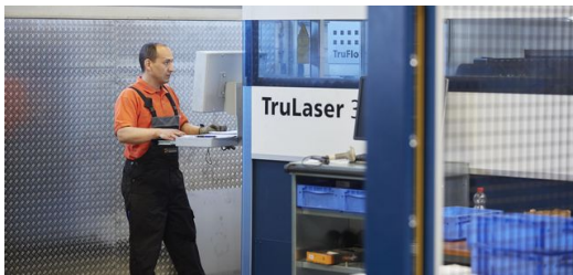
The PalletMaster Tower is programmed with the standard software of the machine and the operation is simple (Photo: Claus Langer).

In addition to speed, flexibility and process reliability, automated loading and removal of the material during the day also eases the operator's work and improves occupational safety. "Our nighttime operations are entirely unattended and, during the day shifts, the tower ensures that my crew no longer has to lug around the heavy and cumbersome large format sheets.