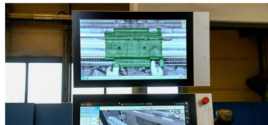
If the Part Indicator shows green, the bending part has been correctly positioned. Thanks to this function, Fischer Maschinenbau has been able to minimize scrap in their sheet metal processing and increase speed.