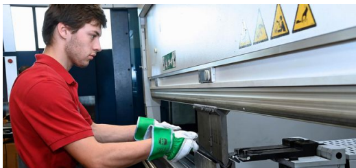
Assistance systems and software help with the work: The TruBend 5230 in use at the Fischer company.