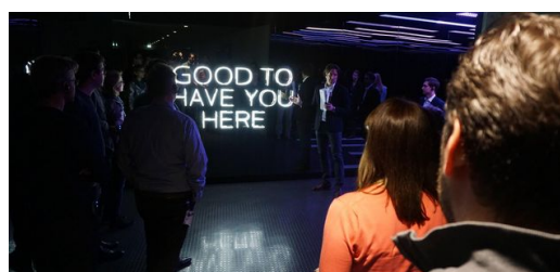
The words in the TRUMPF own tunnel system has been handcrafted exclusively for the company. Electrodes excite the gas in the tubes that form the words, making it light up.