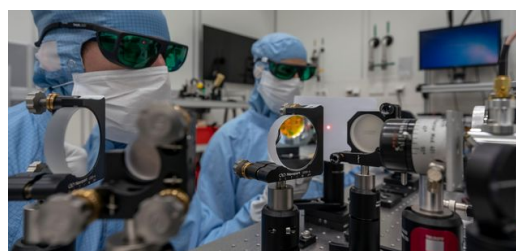
Mirror assembly in the TRUMPF clean room for production of the EUV laser system.