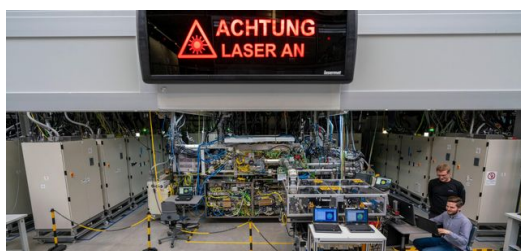
Commissioning of a TRUMPF EUV laser system in an installation bay.