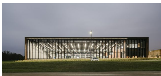
TRUMPF Smart Factory in Chicago, USA.

If Prouvé were to take a tour of the TRUMPF Smart Factory that opened in Chicago in 2017, his heart would probably skip a beat. The 45 x 55-meter cantilevered roof in this fully connected factory is supported by eleven steel trusses welded from individual pieces of steel. All the pieces were cut using the factory's own machines. As a result, visitors – and not just imaginary ones like Prouvé – can appreciate this roof as a great example of what the smart factory's machines can do and experience first-hand just how much laser machines can offer the world of architecture. So what might Prouvé have asked fellow architect Frank Barkow from the architects' firm Barkow Leibinger, which designed the TRUMPF Smart Factory? His first question would probably have been how the building could possibly have had a budget high enough to include such extraordinary structures. He would have been amazed to discover that it wasn't nearly as high as he might have expected—because TRUMPF laser machines were on hand to cut and weld the steel trusses and make the whole roof construction financially viable.