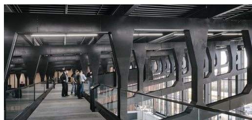
The roof of the production facility at the TRUMPF Smart Factory in Chicago is supported by eleven steel trusses, each made up of many individual