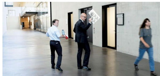
The team of people from the product group, development, purchasing, production, sales, service and project organization departments meets at regular intervals to discuss how development on the TruLaser Center 7030 is progressing.