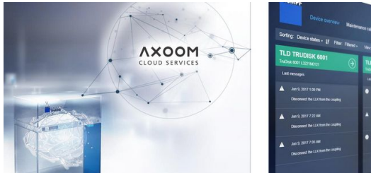
Some of the data is uploaded to the AXOOM Cloud via the Internet.

All data forwarded from the laser systems is reported to Daimler using encrypted data connections. Data logistics and secure IT connections to TRUMPF were designed in a joint process based on mutual trust. Both partners expressed their willingness to learn so that they might profit from the benefits of digitalization. TRUMPF received the 2017 Daimler Supplier Award for this outstanding show of collaboration.