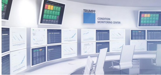
Algorithms and real TRUMPF experts then set to work transforming the data into trend analyses.