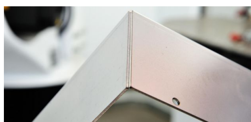
"Tolerant" laser welding is essential for components that have gaps or awkward overlaps. The TruLaser Weld 5000 offers this capability with its optional FusionLine feature.