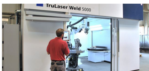
Significant savings: sheet metal fabricator Schink operates its TruLaser Weld 5000 laser welding cell and TruLaser 3040 laser cutting machine in what's known as a laser network. That means the two systems share a 4-kilowatt TruDisk 4001 solid-state laser source.

The Schink sheet metal experts point to the example of the flour duster to illustrate the dimensions of the productivity gains they have achieved. Welding the housing by hand takes about 110 minutes, including some laborious preparations and various finishing steps. With the TruLaser Weld 5000, Schink has introduced a reliable process that gets the same job done in just 10 minutes, including set-up time – and with no finishing work required!