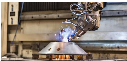
ELFIM uses the Lasercell 1005 for various applications of laser technology such as 2D and 3D cutting or welding and also for laser metal deposition.

perform a 3D scan of an existing replacement part.