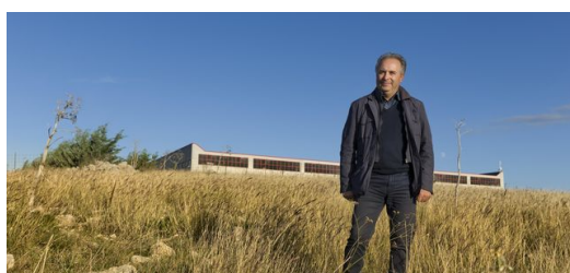
The company ELFIM s.r.l. is situated on a bleak and desolate limestone plateau near Gravina in Puglia.