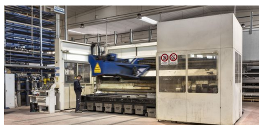
Multi-talented: ELFIM does not just use the LaserCell 1005 to weld and cut 2D and 3D components. The system is also suitable for laser metal deposition.