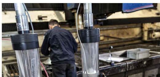
In combination with a powder feeder, the LaserCell 1005 from TRUMPF is also highly suitable for laser metal deposition.

“Strictly speaking, LMD is actually nothing new. It’s a process that has been used for many years now for repairs and coatings. However, we decided to use the process for manufacturing complete components – as is the case with this impeller here.”