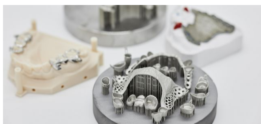
Dentures from the TruPrint 1000 3D printer from TRUMPF.

For example, instead of relying on impression trays, CADSPED offers its clients the use of so-called intra-oral dental scanners. These are manual scanners equipped with sensor systems, which dentists can use to digitally map the patient's mouth in 3D. This data can then be processed further directly, negating the need for a plaster cast. As a result, the whole process is faster, more affordable, and more precise.