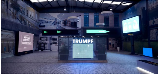
Authentic: Cobblestones in the showroom help provide an authentic atmosphere.