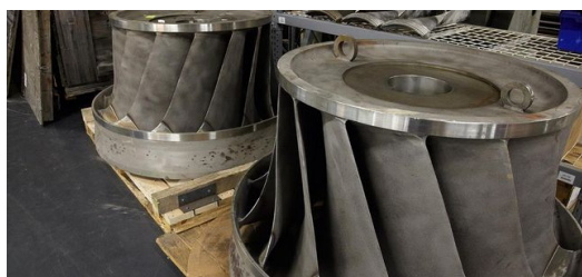
Laser-cladded turbines: "Does it work?" is a question Dan Hayden often hears.

Cylinders and wearing surfaces are pretty common geometries for us, but we work on a broad range of applications. We've cladded some very large parts – blades for hydroelectric turbines 1.5 meters in diameter, for example – but also small parts measuring just 1.5 centimeters.