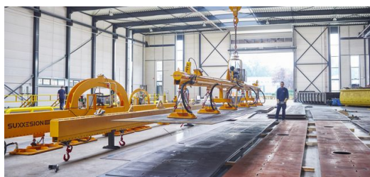
The Spanish eye-catcher cuts giant sheets and plates for truck bodies, ship hulls and buildings.

Two cutting heads dance across the sheet, cutting the specified shapes. Both of these optical systems are mounted on a single portal that moves over the sheet in the direction of cutting. As soon as a sheet has been cut, the roller gates ascend and the booth moves on to the next sheet. "This approach allows us to cut five or even ten sheets in one go, depending on sheet size."