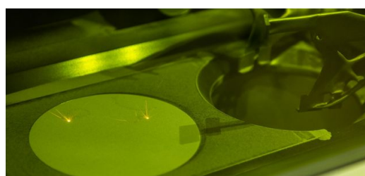
The pulsed laser in TRUMPF's TruPrint 1000 is an excellent choice for creating high-quality surfaces. Its multi-laser capabilities enable highly productive manufacturing processes.