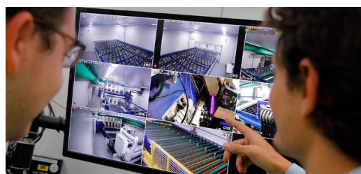
Heating the glass coating very briefly to a high temperature is an essential part of the hardening process. The glass experts at Saint-Gobain spent five years working on their rapid thermal processing method.