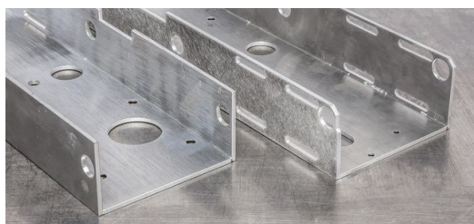
An aluminum U-shaped profile with close fit areas, holes and notches. In the past this was milled from solid material but now it is cut with the laser and joined at the base with deep welding. The savings, when compared with the previous costs, come to 95 percent.

Here they count on our expertise right from the part design phase," says Neumann. The best example is a U-shaped aluminum profile with close fit areas, holes and notches. In the past this was milled from solid material. "Now we cut the parts with the laser and deep-weld them at the base. Thanks to the low degree of thermal input, there is no distortion. We brush over the seams and thus save 95 percent of our previous costs. It goes without saying that the customer is thoroughly satisfied," Neumann reports.