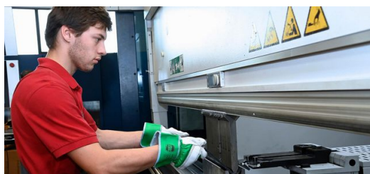
Assistance systems and software help with the work: The TruBend 5230 in use at the Fischer company.