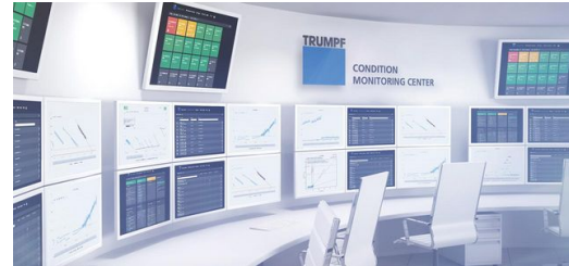
Algorithms and real TRUMPF experts then set to work transforming the data into trend analyses.