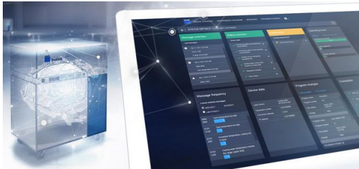
TruDisk disk lasers collect data derived from the lasers, processing optics and process sensor.

To supplement the expert knowledge of TRUMPF's employees, Smart View Services have been introduced. These enable Daimler employees to detect and resolve many minor anomalies on their own, thanks to the user-friendly live overviews provided in the central customer portal. Anyone with access to a PC or smartphone can check the status of the plant, at any time and from anywhere in the world. As a result, the availability of the laser welding machines has increased significantly.