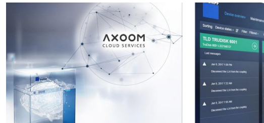
Some of the data is uploaded to the AXOOM Cloud via the Internet.