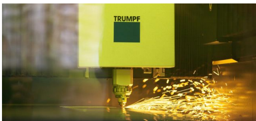
In March, FBT workers started using their new TruLaser 3030 to cut thin sheets and blanks to size.