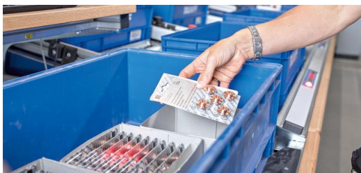
Order Preparation.