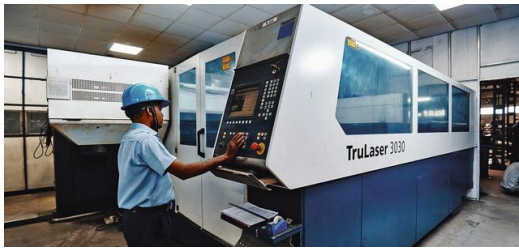
Universal Engineers relies on TRUMPF technology for laser welding of trains.