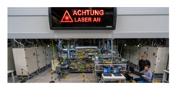
Commissioning of a TRUMPF EUV laser system in an installation bay.