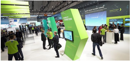
Thanks to the green T-shirts of the TruConnect consultants, visitors who had questions about the TRUMPF solutions for the Smart Factory quickly found what they were looking for.