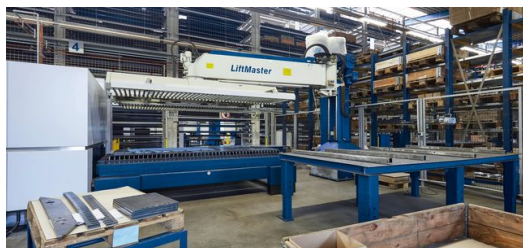
A Stopa storage system takes care of supplying materials while a LiftMaster makes it easier to handle parts.