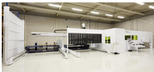
“Automating our machines eases the work for the employees. Instead of tedious and troublesome loading and unloading operations, they can devote their attention to other tasks during production operations,” Sander Mutsaers explains.

“Even after this short period in use we have been able to reduce by 40 percent the time needed to manufacture the front panel of a pay-and-display machine, made of aluminum and stainless steel. The separate working phase at the press brake for small bendings is eliminated because the new punch laser cutting machine already takes care of the necessary bends,” he tells us. Formed areas – like brackets, threads and hinges – are now made up quickly and easily on the TruMatic 6000 fiber. Four TRUMPF press brakes are used when processing larger parts and assemblies.