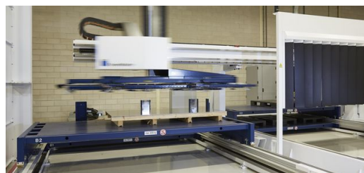
The SheetMaster is entrusted with loading and unloading the machine. It sorts the parts and lays them on the cart or pallet.