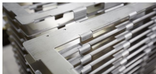
The front panel of a pay-and-display machine.