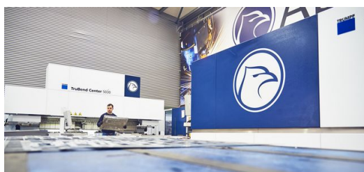
Most up-to-date technologies: Worker with the TruBend Center 5030