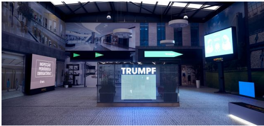
Authentic: Cobblestones in the showroom help provide an authentic atmosphere.