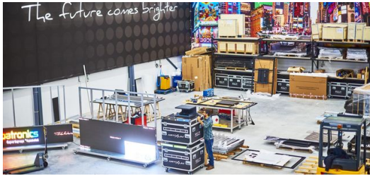
Tailor-made: Apametal develops and builds each digital sign itself. – Frederik Dulay-Winkler