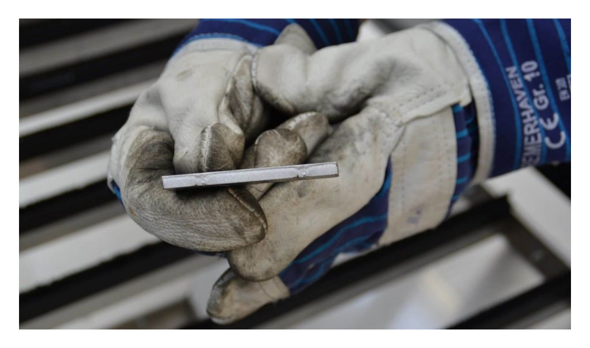
The 2nd advantage nanojoints: After the worker has cut the components out of the sheet, there is hardly any visible damage to the contour of the components. Manual reworking is either eliminated or minimized. This saves time and the staff can attend to other tasks.