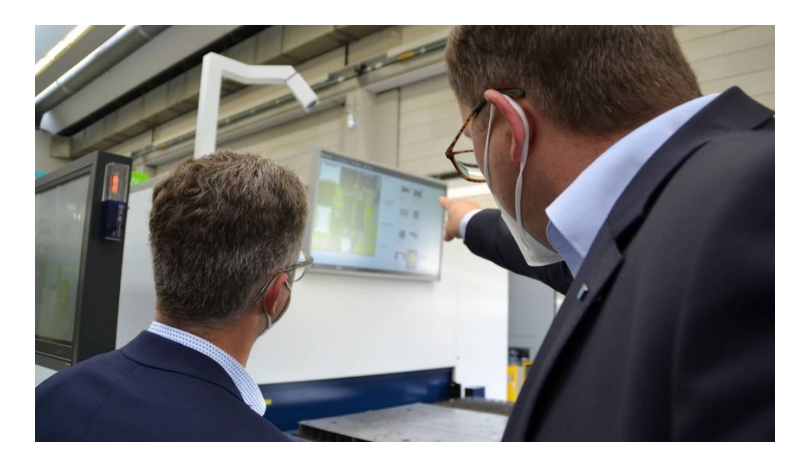
Artificial intelligence meets sheet metal: Which component belongs to which order? The TRUMPF Sorting Guide solution eliminates the need for lengthy searches. Thanks to smart cameras, workers can see on the large screen which components belong together and where they need to work.