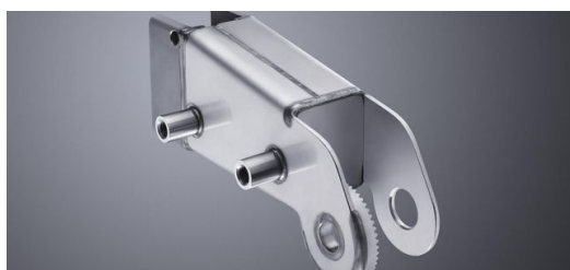
TRUMPF Medizin Systeme setzt in der OP-Tisch-Fertigung auf die Pluspunkte vom Laserschweißen.

This article was first published in May 2014.