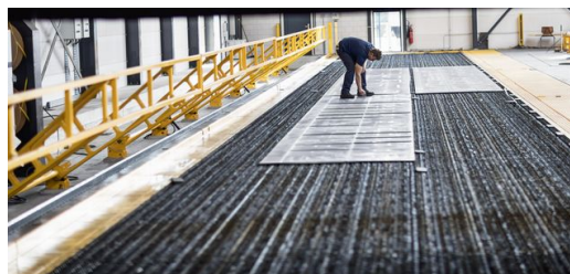
Because the table of the laser machine is at ground level inserting sheets is easy.