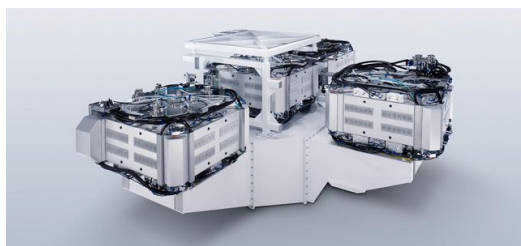
Since the beginning of 2014 TRUMPF has delivered its third-generation laser systems to ASML in Netherlands, the only manufacturer of EUV photolithography systems in the world.

Secondly, it is only the wavelength of 13.5 nanometers that makes it possible to manufacture the layer systems required for optical imaging at sufficiently high reflectivity. Refractive optical elements – such as lenses – absorb this wavelength. That is why EUV systems work exclusively with mirrored optical elements. The very short wavelength is also the reason why the entire process has to take place in a vacuum, since air would also absorb the EUV radiation.