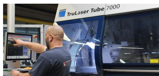
The finished program appears on the machine operator's terminal.