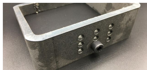
The TruLaser Tube 7000 can be used to fabricate a range of different threads in tubes.

Since the summer of 2017, the company's plant in the Swabian Jura region has been using a test unit of the TruLaser Tube 7000 laser tube cutting machine with integrated tapping system. "We are delighted to be working with TRUMPF on this kind of collaborative project, and we are certainly impressed with the new technology," says Frank Steinhart. The CO2 laser cuts tubes and profiles without leaving burrs and offers bevel cuts of up to 45 degrees, diameters up to 254 millimeters and wall thicknesses of between one and ten millimeters.