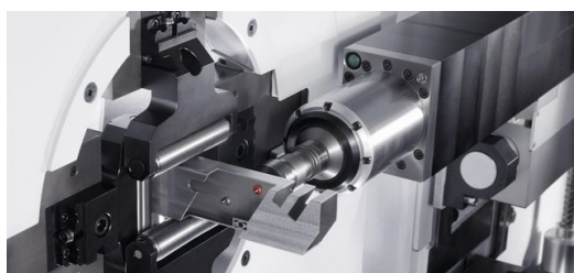
The latest version of the TruLaser Tube 7000 comes with an thread tapping system. The built-in package caters to both standard thread tapping and flow tapping.