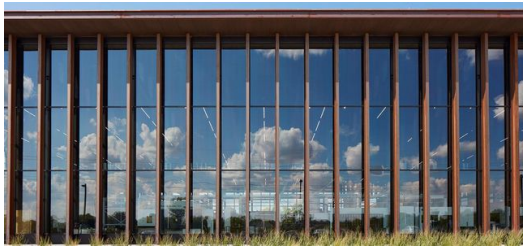
The focus of the Smart Factory is to advise and train customers on the introduction of digitally connected production solutions.