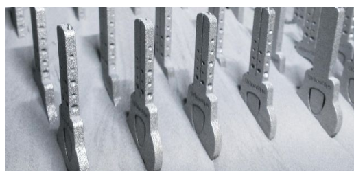
The 3D printing process enabled the young engineers to completely redesign the traditional key.

The more researchers discover about laser light and how it works, the more these findings give rise to ideas for applications and business concepts. Similar to the famous “Stanford boys” of Silicon Valley, many of this latest batch of start-up founders are post-grads and post-docs who spin off a market-able idea from their research work and then team up with venture capitalists who have their eye on a profitable investment. The fact that these ideas stem from general research rather than a narrowly-framed user problem makes them more diverse than ever before.