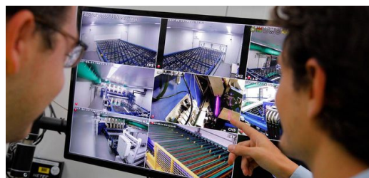
Heating the glass coating very briefly to a high temperature is an essential part of the hardening process. The glass experts at Saint-Gobain spent five years working on their rapid thermal processing method.