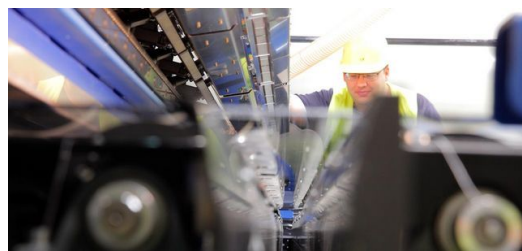
Strahlfallen befinden sich oberhalb und unterhalb der Laserlinie.