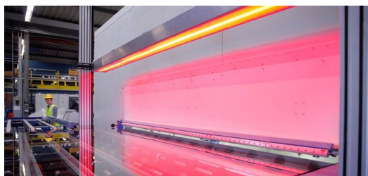
An ultrathin laser line — thinner than 100 micrometers — briefly heats the functional coating on sheets of glass to over 500 degrees.

Lorenzo Canova, RTP project leader at Saint-Gobain Glass Germany, says: "We were sure that a short, high burst of heat that heats only the coating and not the glass substrate can be accomplished only using a laser with high efficiency." The glass specialists developed a laboratory facility with a complex laser unit as its centerpiece. Using rapid thermal processing, they created a procedure that enabled them to verify their chosen approach. So far, so good.