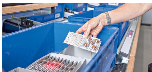
Order Preparation.