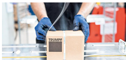
Order Picking.