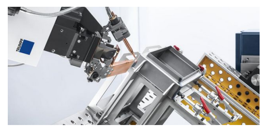
The FusionLine joining technique can be used to join parts, even when this involves the bridging of gaps. It smooths out any unevenness during the welding process and closes gaps up to one millimeter wide. That makes it possible to use the laser on many parts that were originally designed for conventional welding methods.

Exploiting the full potential of laser welding