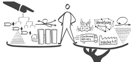
For a flexible organization, you need both stability and agility.