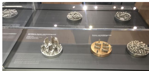
Substrate plates with 3D-printed dental prosthesis.