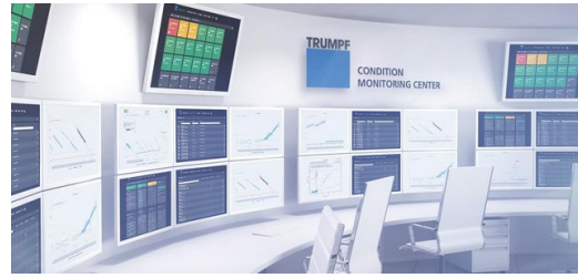
Algorithms and real TRUMPF experts then set to work transforming the data into trend analyses.